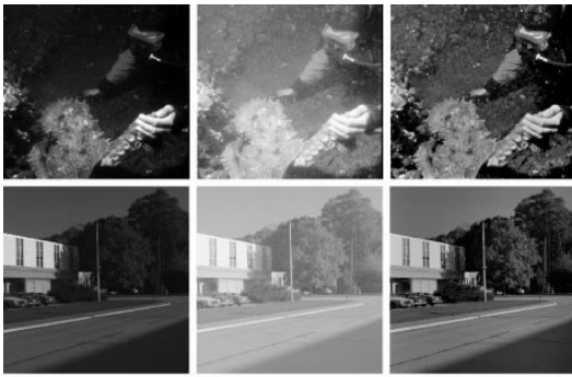
(a) Original (b) Homomorphic filter (c) MSRCR

row: gain/offset; fourth row: gamma non-linearity; bottom row: MSRCR