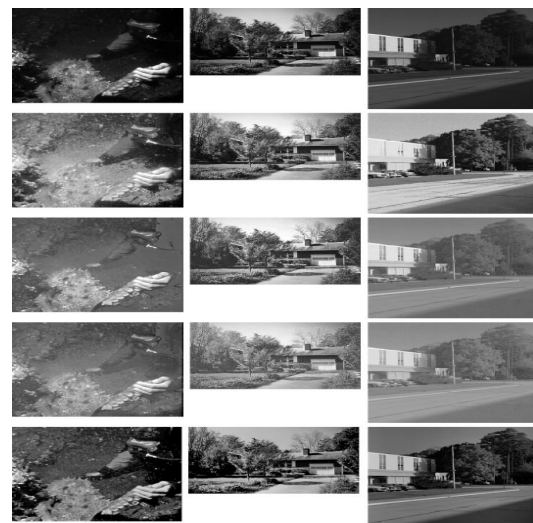
Fig. 1: A comparison of the MSRCR with point operations. Top row: original; second row: histogram equalization; third

The automatic nature of the process additionally permits us to apply the identical set of parameters 'blindly' for each and each picture this is encountered. Of course, there are a few snap shots for which the MSRCR has sub-par performance. But these are pretty uncommon and usually relate to defects in the unique Image information—including preferential clipping of a spectral band. We are presently investigating techniques to hit upon such scenes and adaptively adjust the MSRCR to accurate for these sub-par performances.